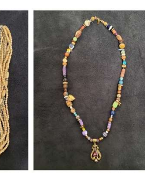
Silent Item #23